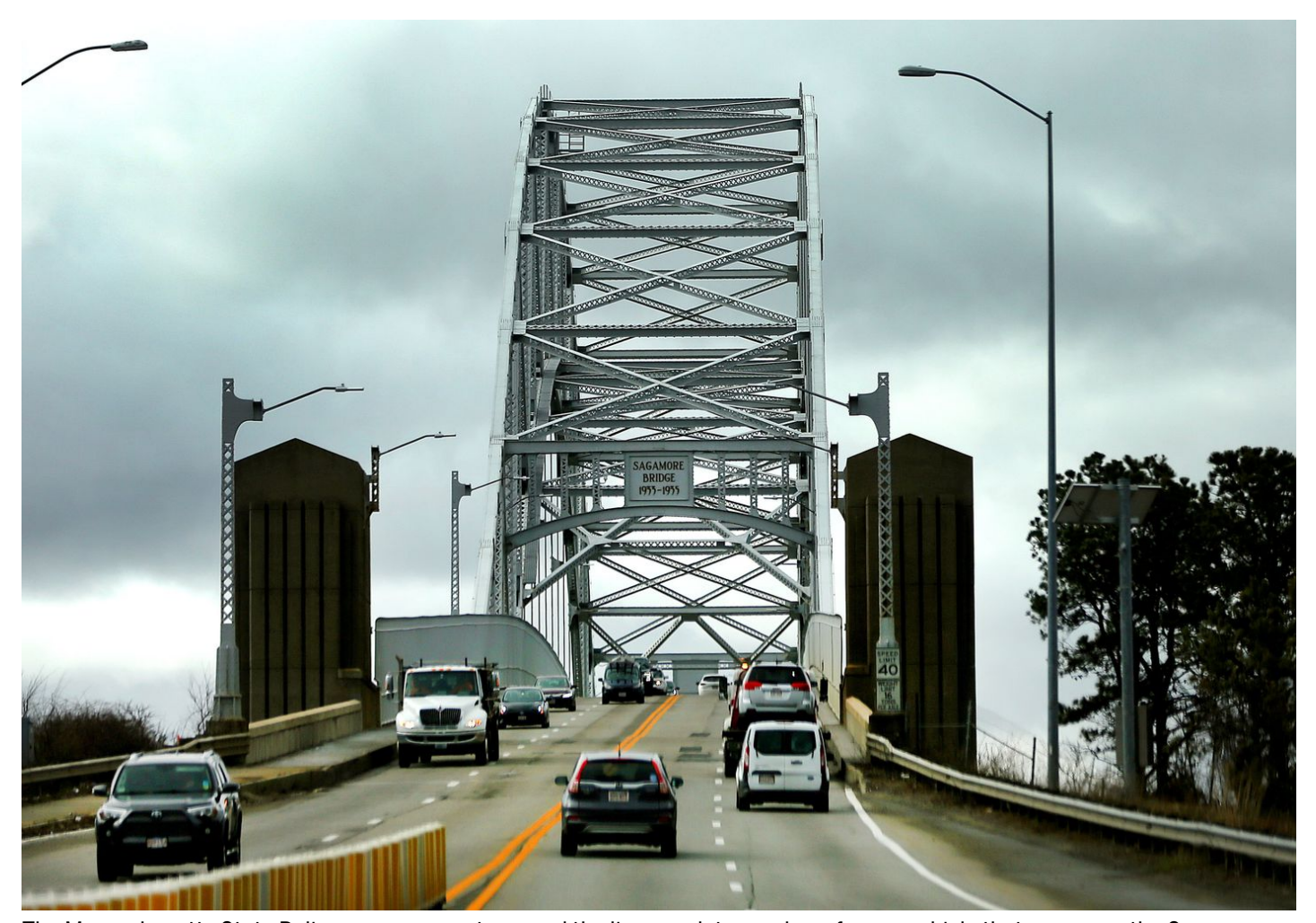
The Massachusetts State Police use cameras to record the license plate number of every vehicle that goes over the Sagamore (above) and Bourne bridges, among other roadways.